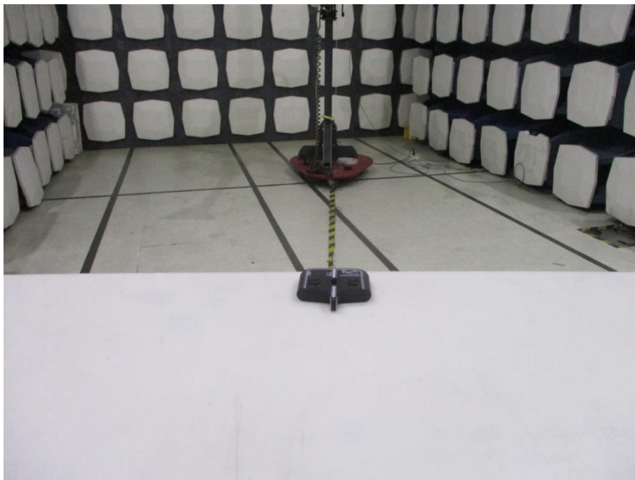
Back View (Below 1GHz)