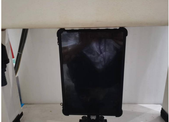
Fig-4.3 Left Side of EUT with 0 cm Gap (Body Mode)