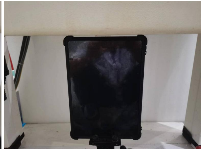
Fig-4.4 Right Side of EUT with 0 cm Gap (Body Mode)