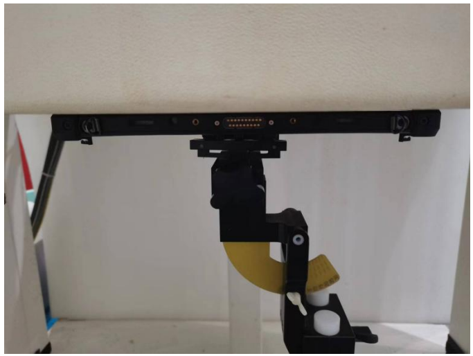
Fig-4.1 Front of EUT with 0 cm Gap (Body Mode)