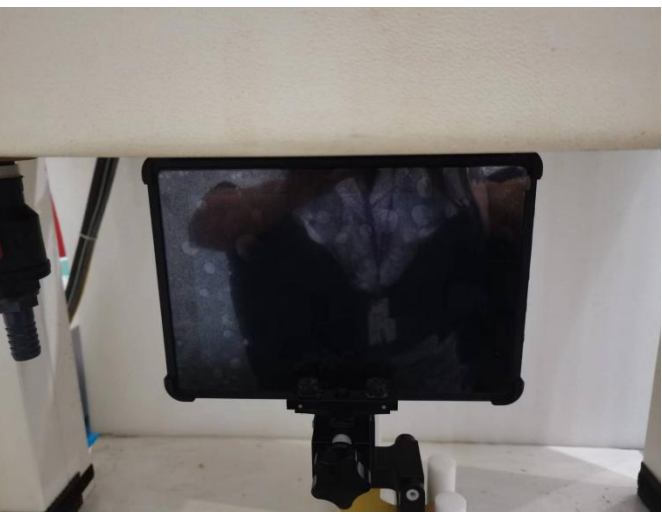
Fig-4.6 Bottom of EUT with 0 cm Gap (Body Mode)