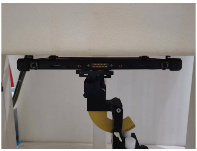
Fig-4.2 Rear Face of EUT with 0 cm Gap (Body Mode)