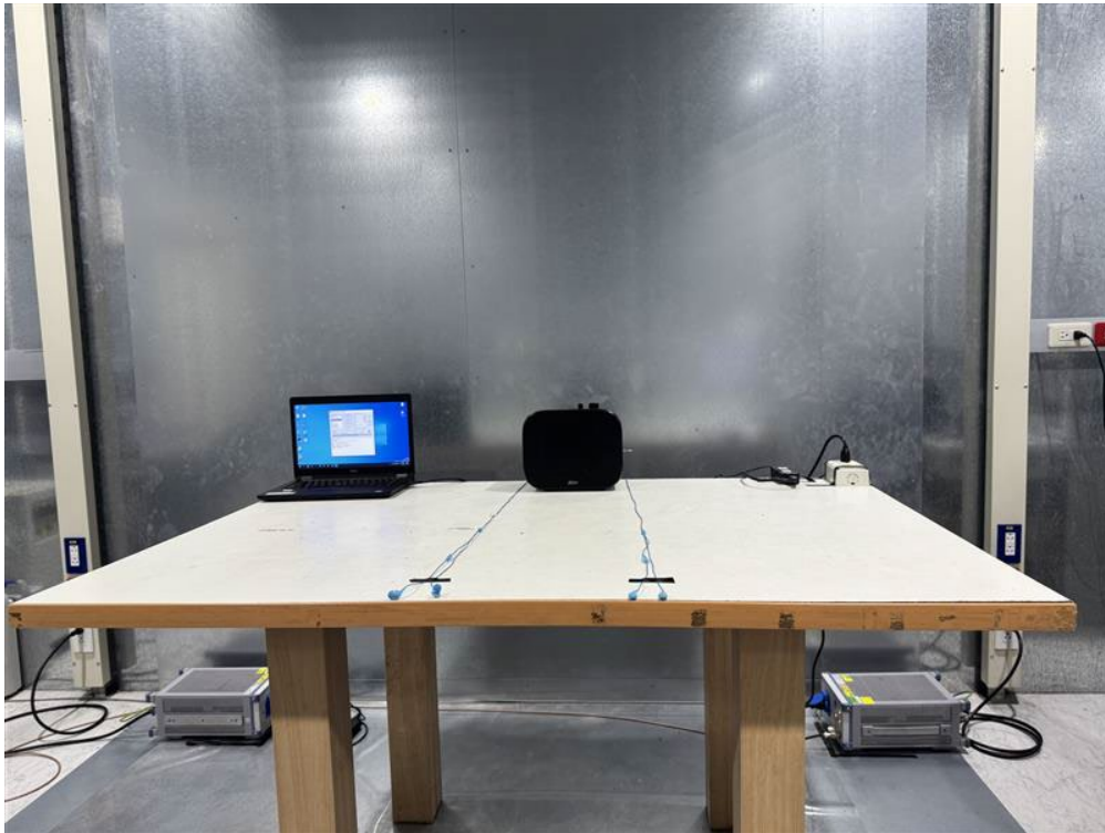
Back View of AC Power Line Conducted Emission Test