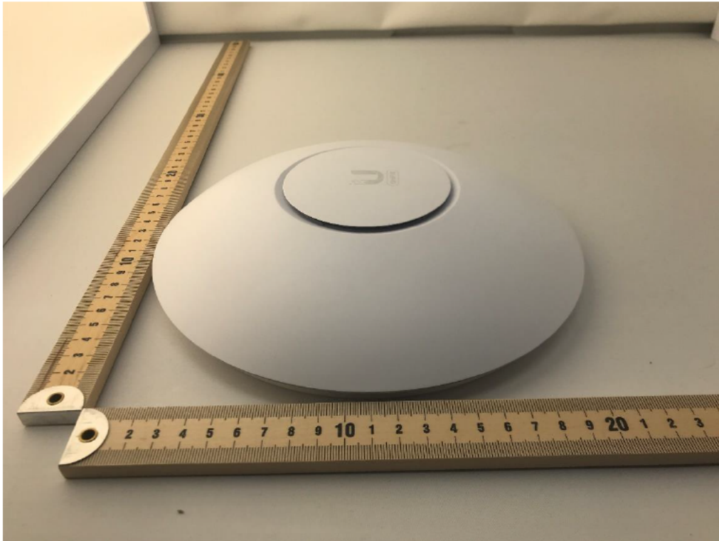
Photograph 5: Left-Side View of DUT