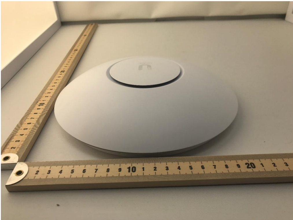
Photograph 4: Top View of DUT