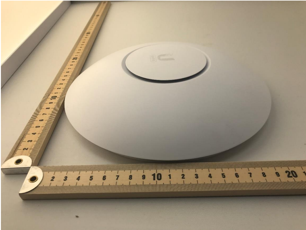
Photograph 3: Right-Side View of DUT