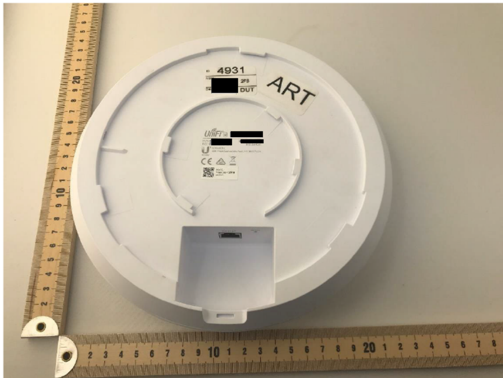
Photograph 6: Back View of DUT