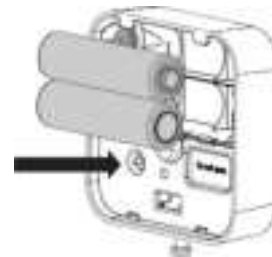
Figure 3 Press the tamper button

Caution: The EN1248 should be tested after registration to ensure operation. To test the EN1248, activate each of the conditions and ensure an appropriate response.