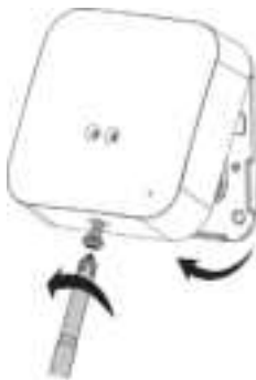
Figure 1 Remove the glassbreak detector from the base