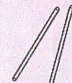
2 Vehicle Antenna Tubes