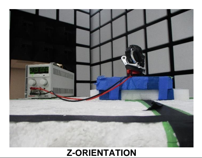
END OF TEST REPORT