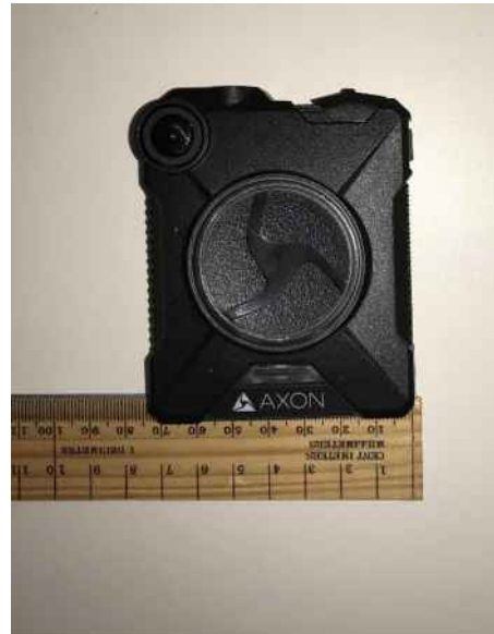
Conducted Measurements Setup