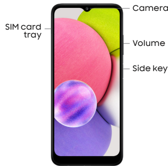
Charging & Audio port