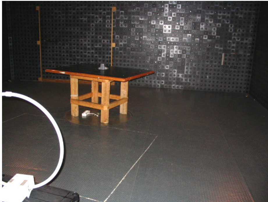
Photograph No.1 Setup for spurious emission measurements in the anechoic chamber below 30 MHz