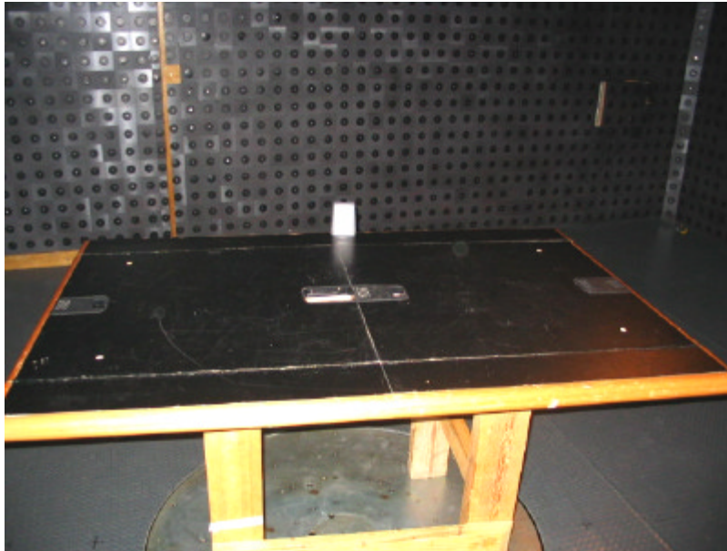
Photograph No.6 Setup for radiated emission measurements according to §15.109, close view