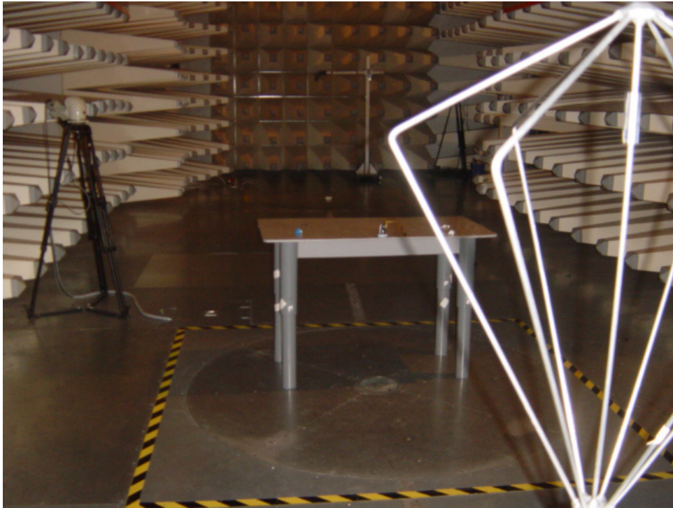
Set-up for Radiation Emission (Transceiver)