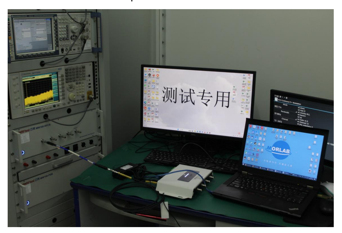
(Bluetooth LE, WIFI 2.4G)