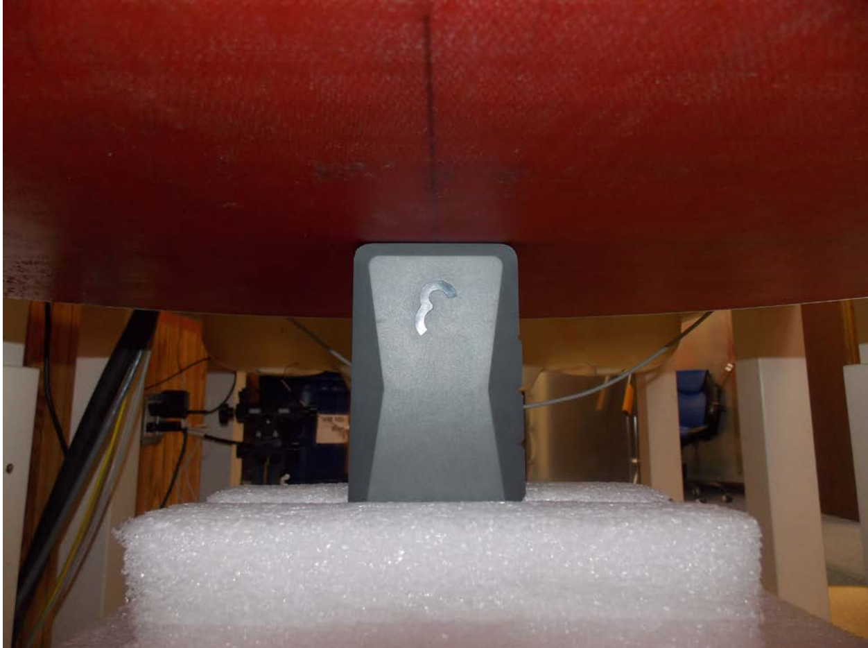
Test Position Bottom 0 mm Gap