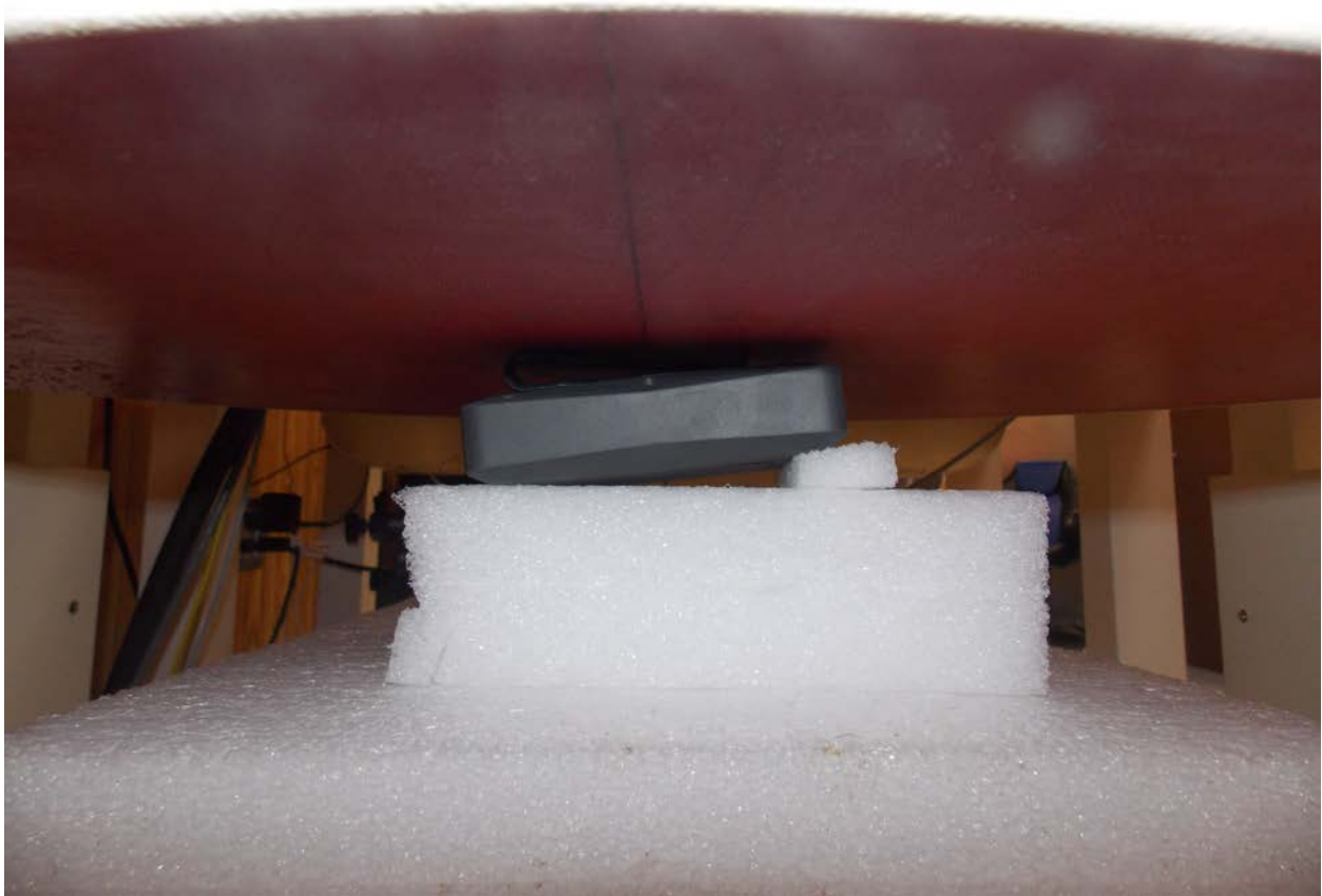
Test Position Back 0 mm Gap