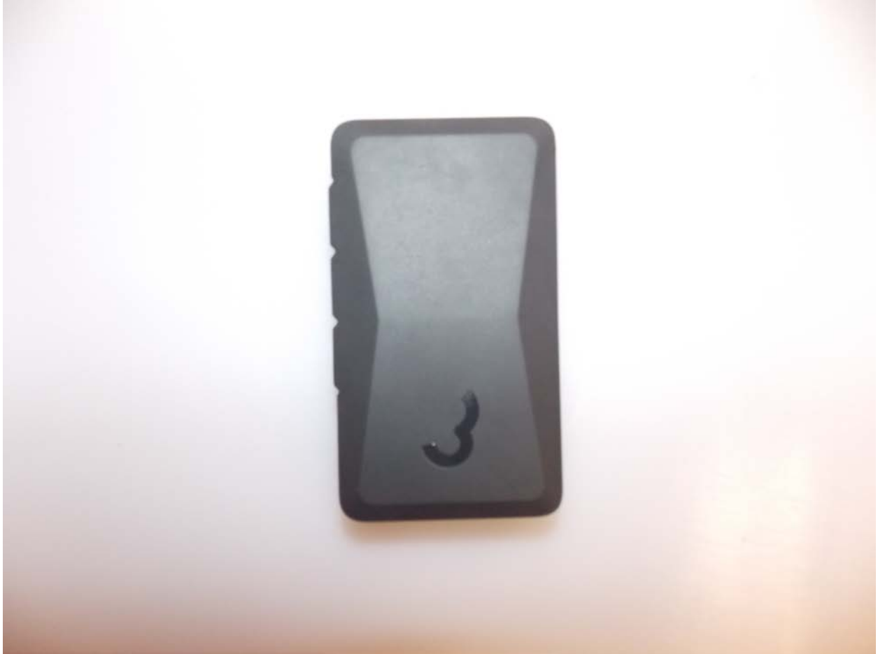
Front of Device