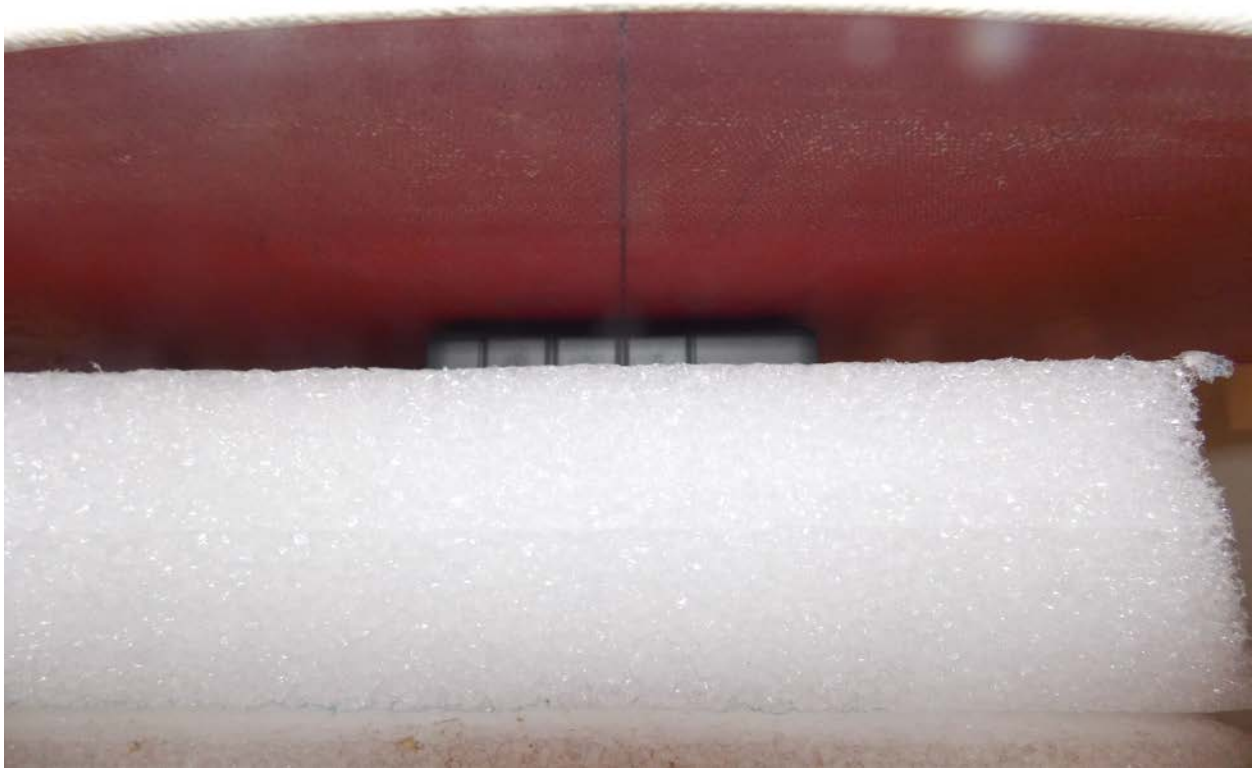
Test Position Front 0 mm Gap