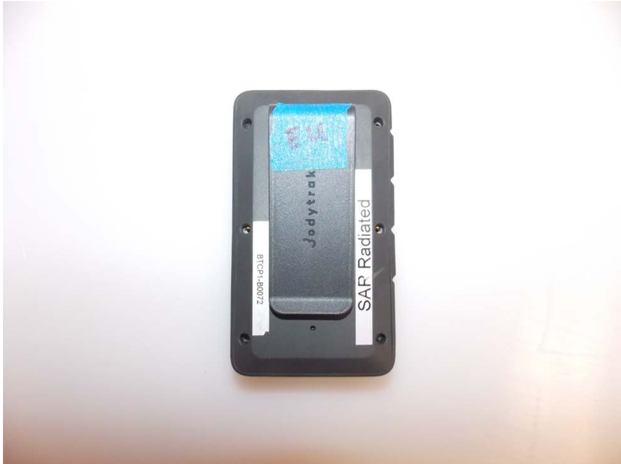
Back of Device