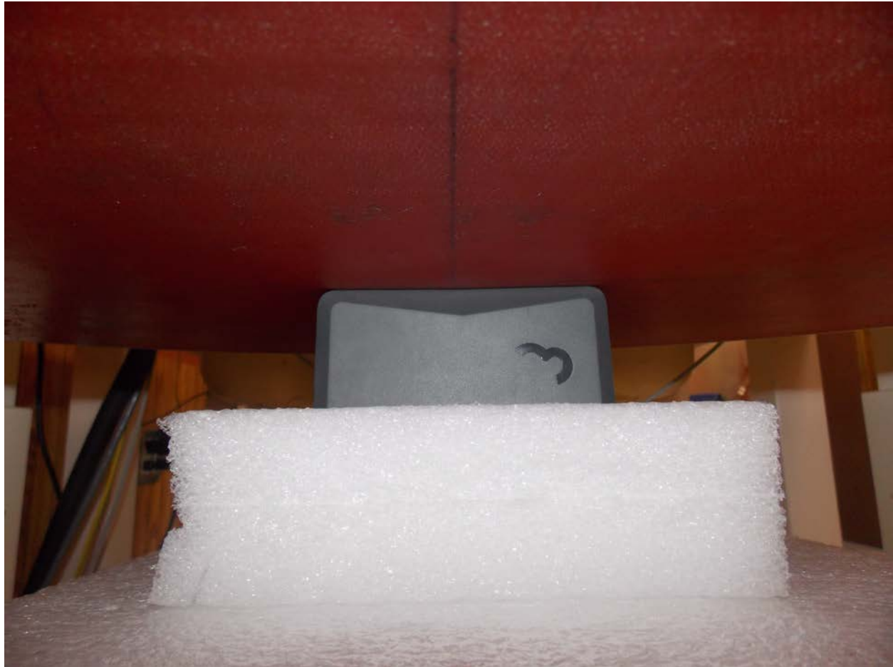
Test Position Right 0 mm Gap