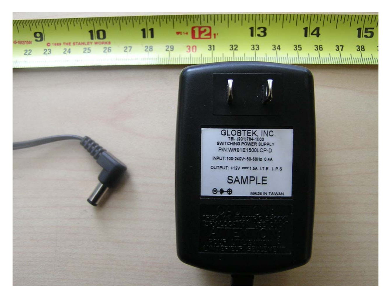
AC/DC PWR SUPPLY