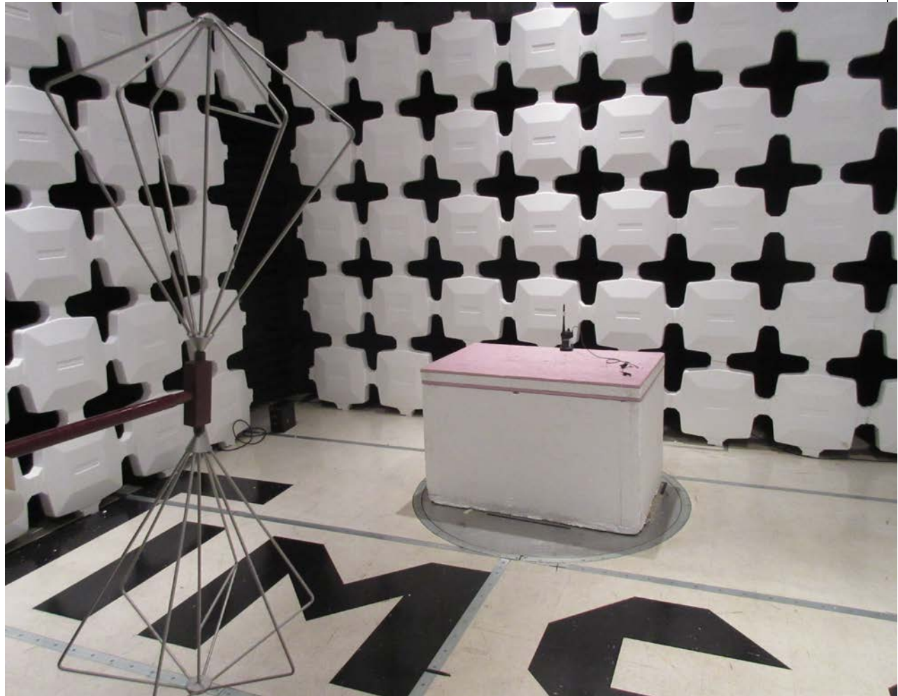
Radiated Setup Below 1GHz

APPLICANT: YAESU MUSEN CO., LTD. FCC ID: K6620665X20