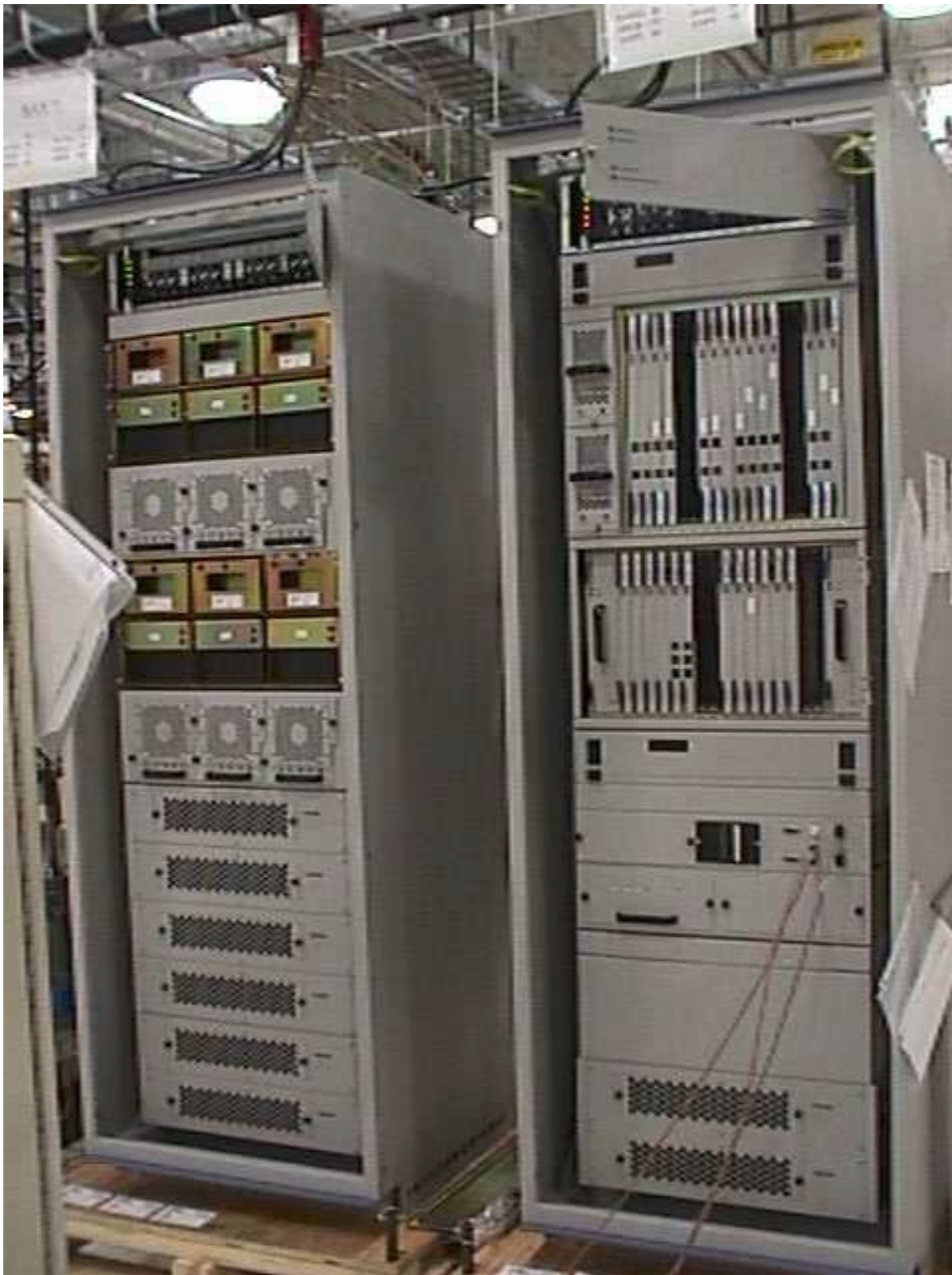
Exhibit 5 Front View, OJYDFK2