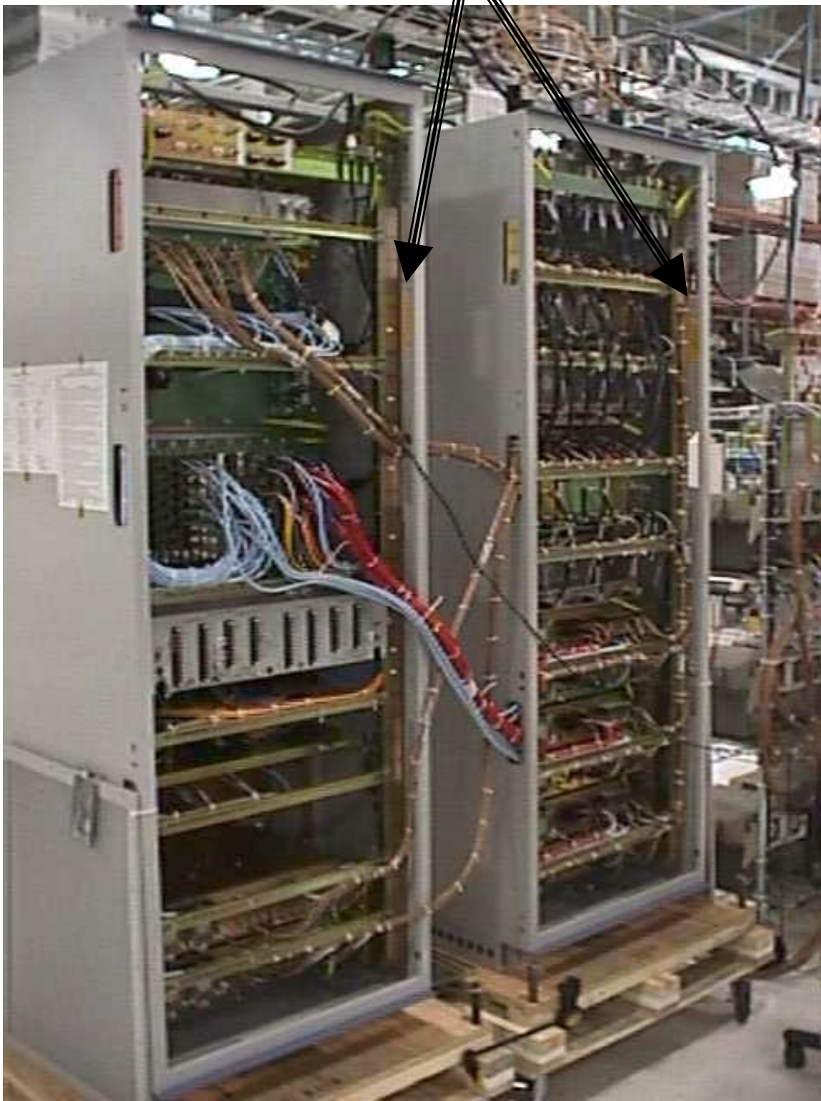
Exhibit 4 Rear View, OJYDFK2