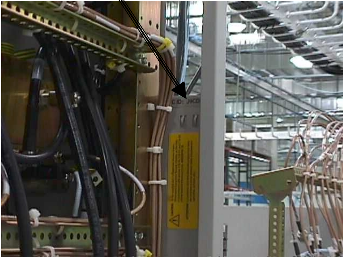
Exhibit 3 FCC ID Label Location, OJYDFK2