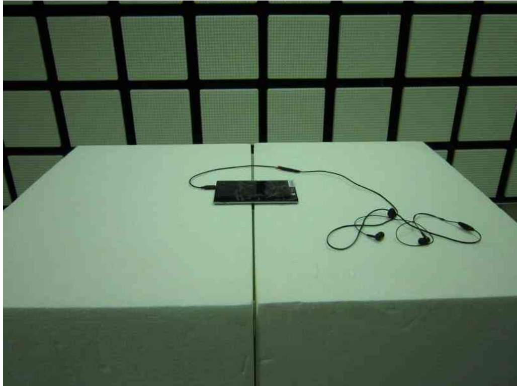
– X-axis –