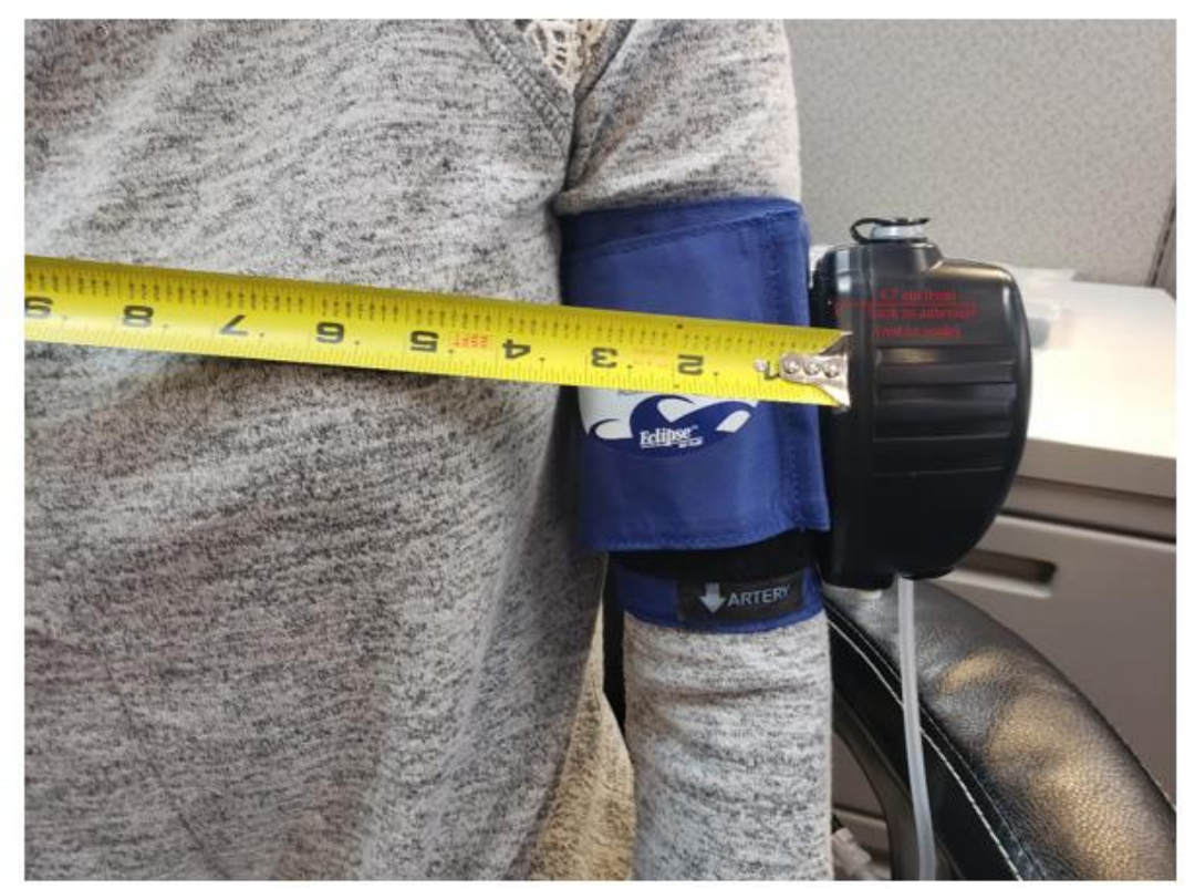
Figure 1. Normal use and position of WVSM on the body.