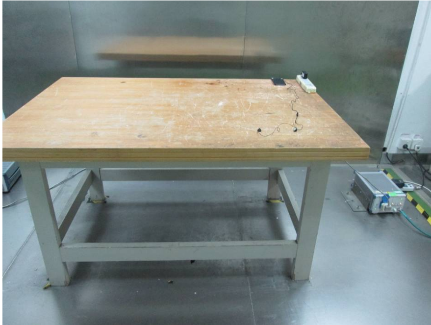
Conducted Emissions - Side View