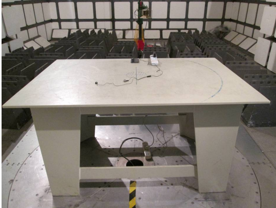
Radiated Emissions – Rear View (1-25 GHz)