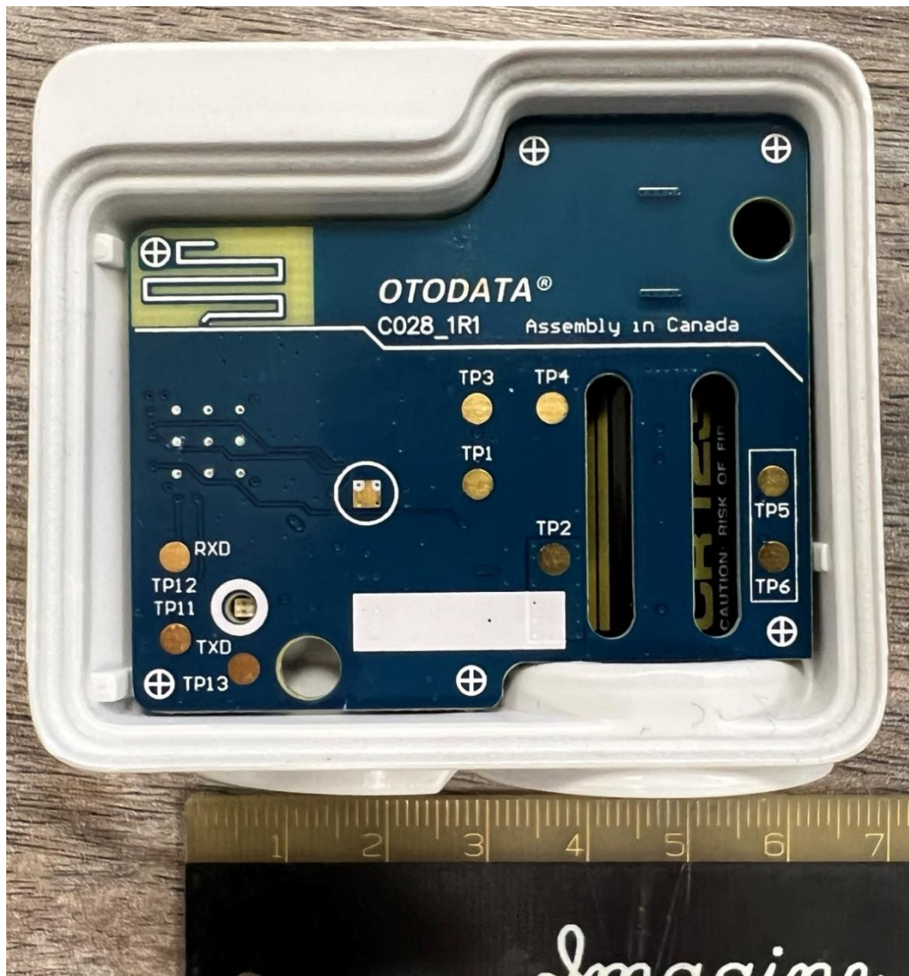
Figure 1: Internal view