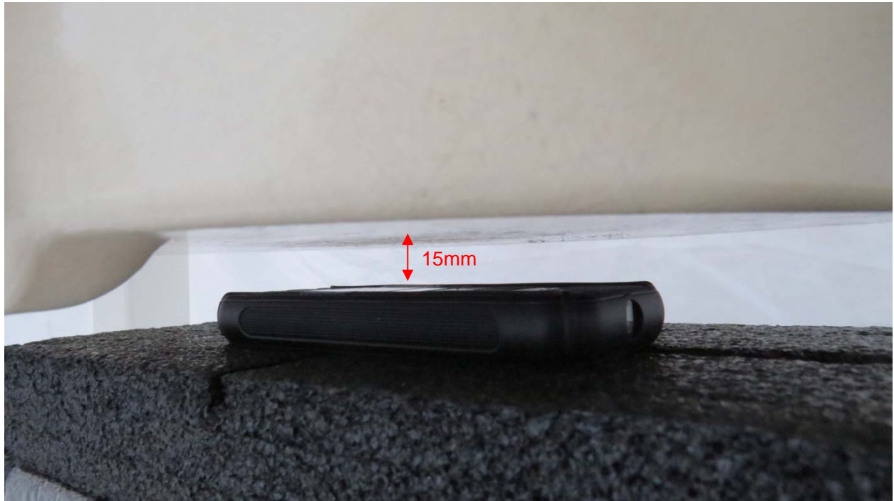
Picture 5: Back Side, the distance from handset to the bottom of the Phantom is 15mm