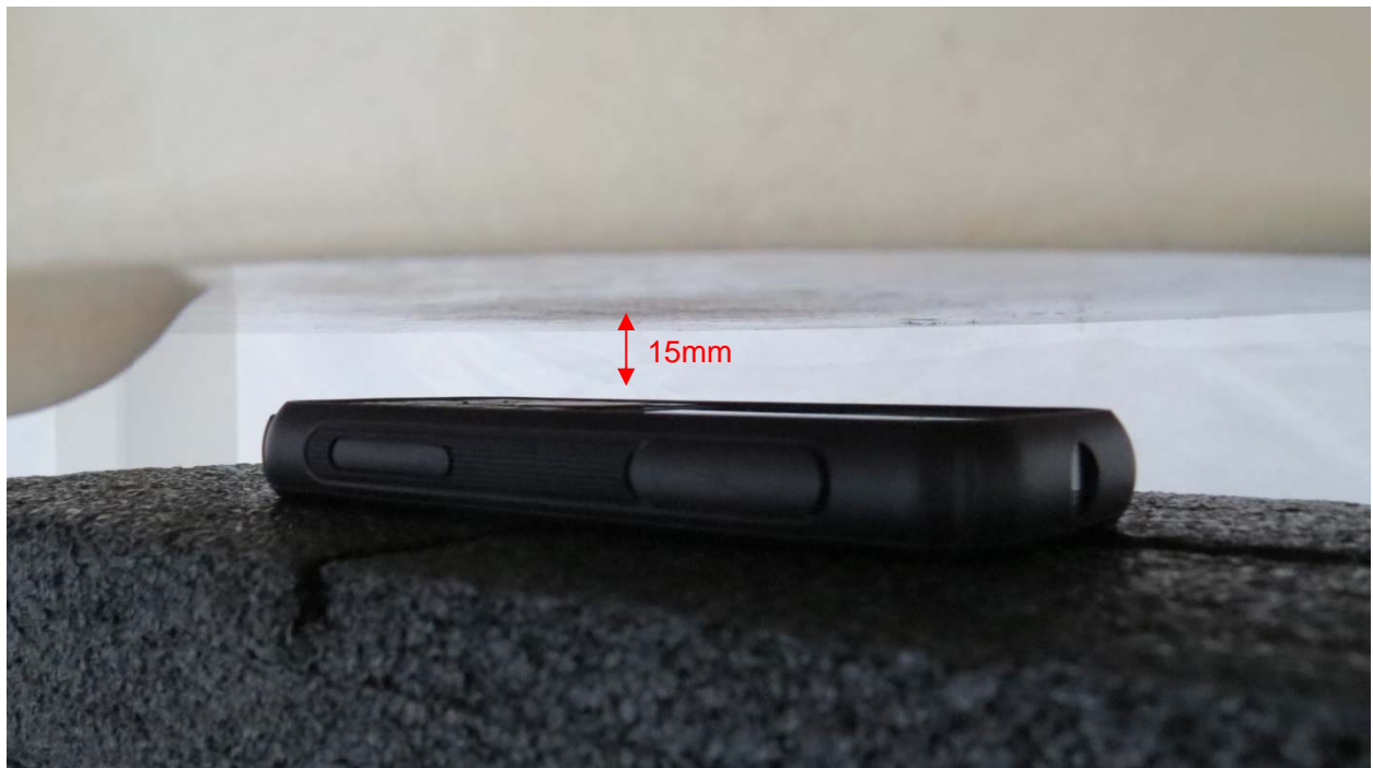
Picture 6: Front Side, the distance from handset to the bottom of the Phantom is 15mm