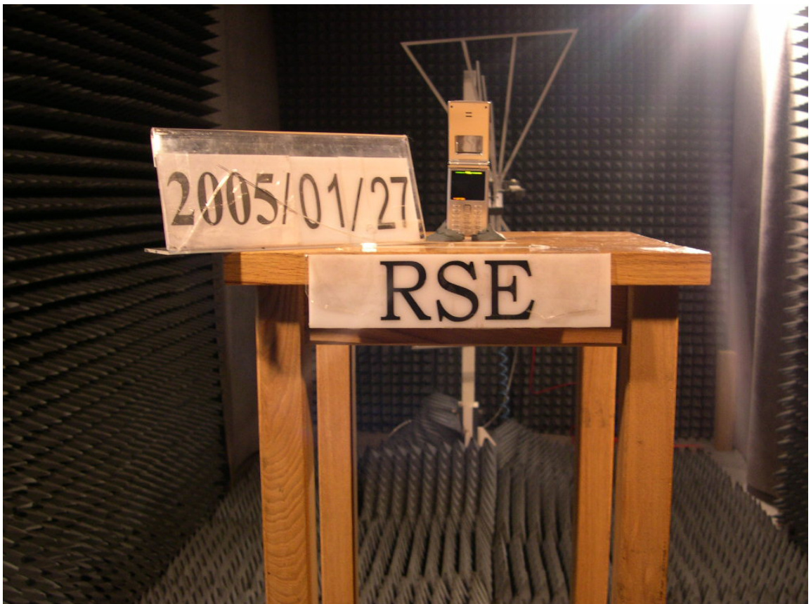
Pic2 Radiated Spurious Emission