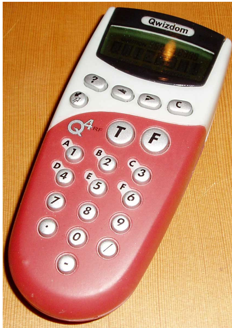
Fig 3 – Front of Q4 RF