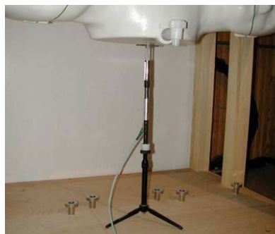
Figure 8-2 System Verification Setup Photo