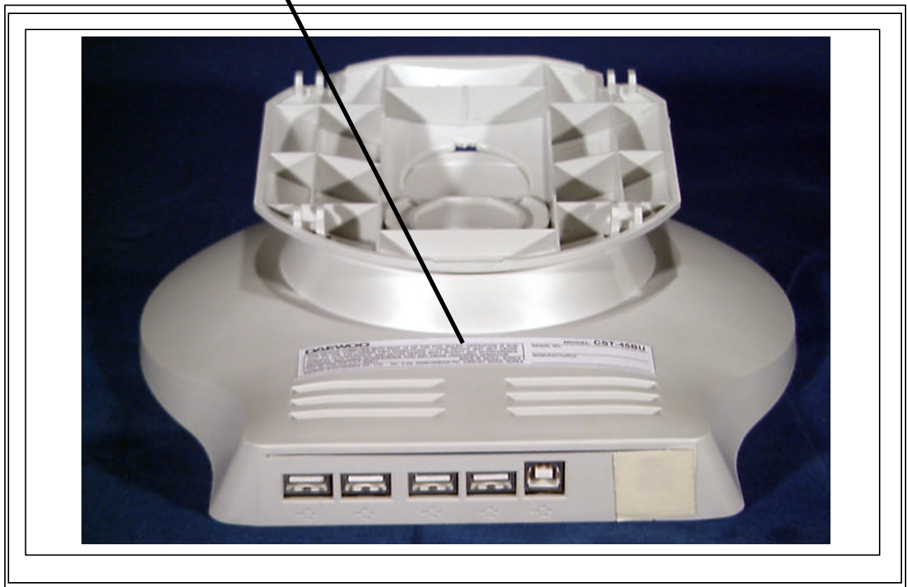
Fig 12. Sample label

The Label shown shall be permanently affixed at a conspicuous location on the device and be readily visible to the user at the time of purchase.