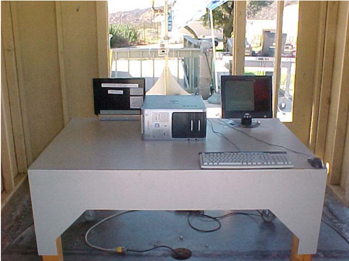
Radiated Emissions Measurement (Front View) Whayu (Fujitsu Topaz) Antenna Setup