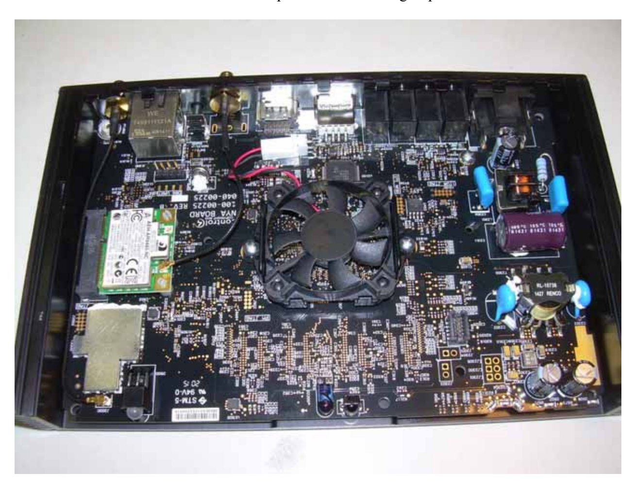
View of the EUT with Top Removed Showing Top Side of PCB