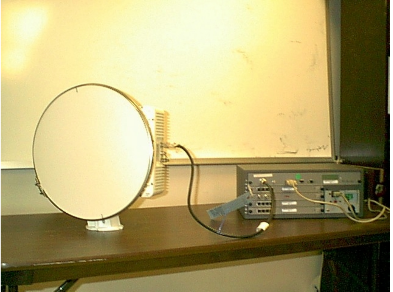
Figure 5 ODU and IDU – Front View