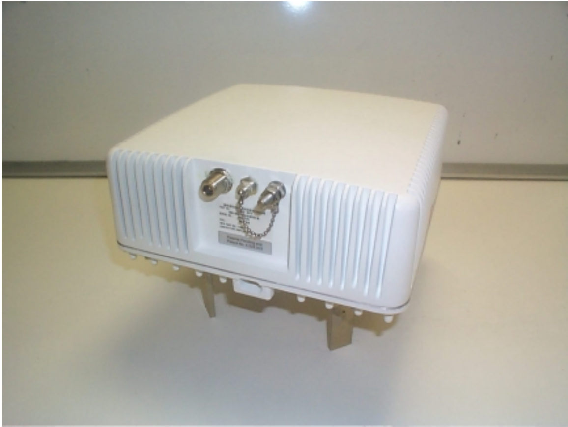
Figure 1 Front View1