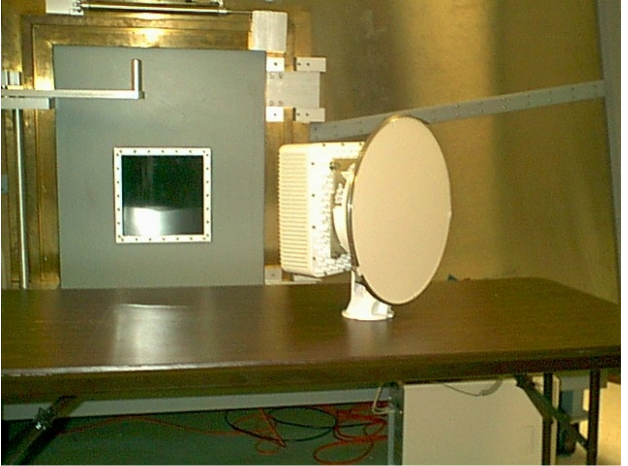
Figure 4 ODU and Antenna - Front View