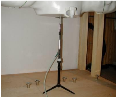
Figure 8-2 System Verification Setup Photo