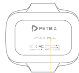
Device ID (on back of device)