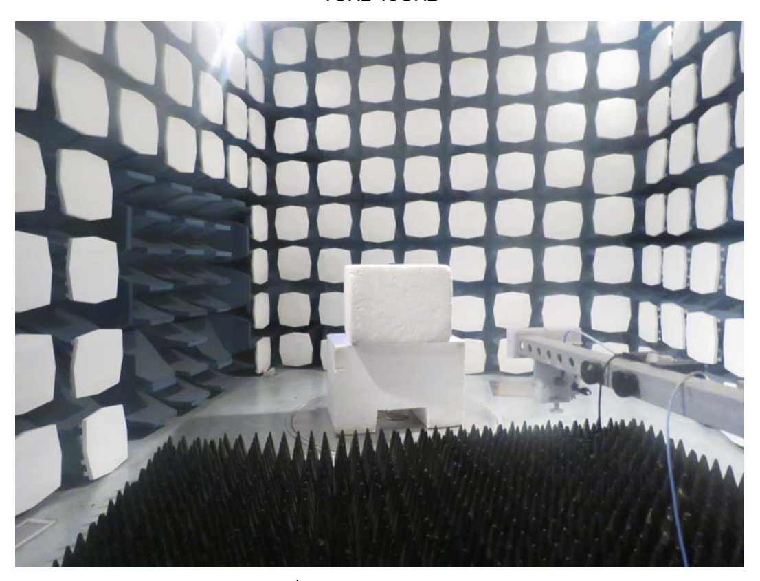
18GHz - 26.5GHz Picture 1 Radiated Emission Test Setup