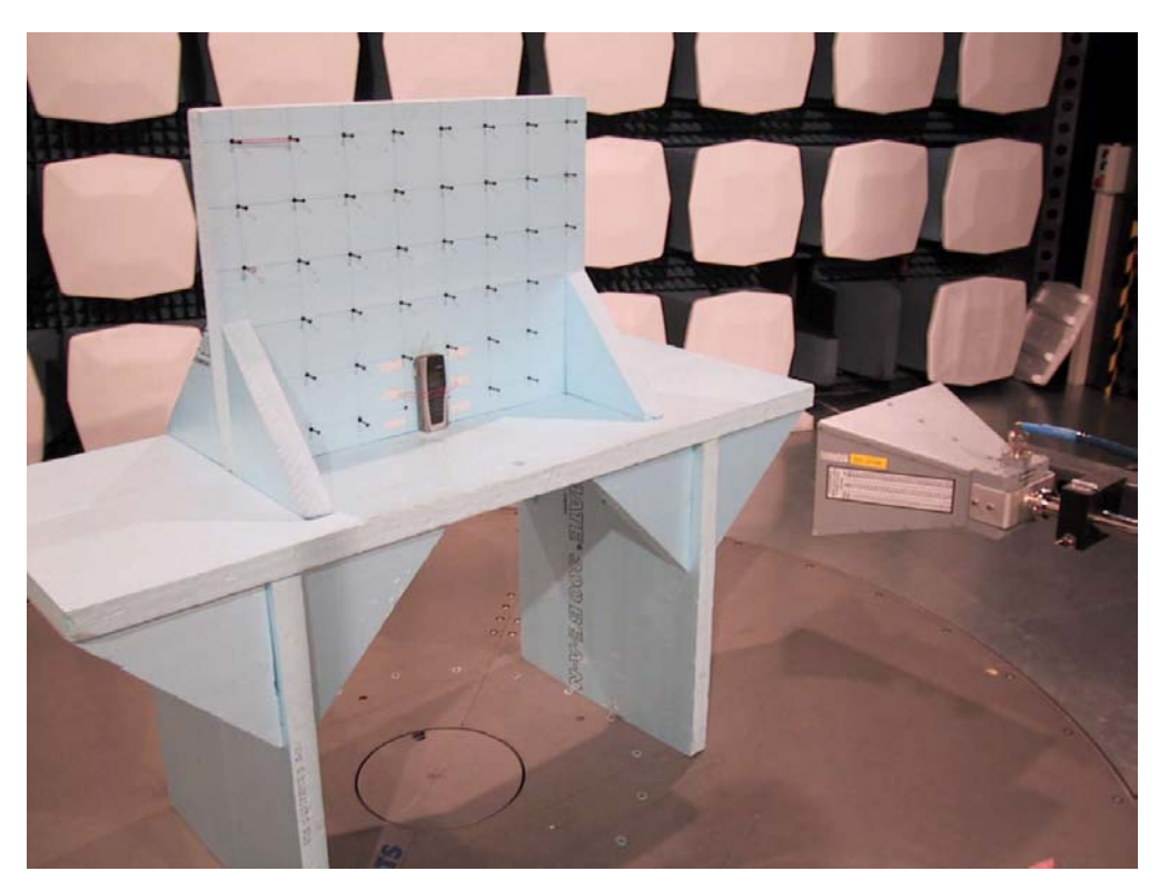
Picture 3: Radiated spurious emission measurement set-up for above 3 GHz measurements, EUT in vertical orientation

Tel: +358 20 475 2600 Fax: +358 20 475 2719 Email: firstname.surname@ette.com