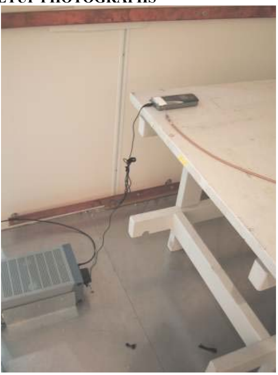
AC-power line conducted emissions test setup Picture 1: