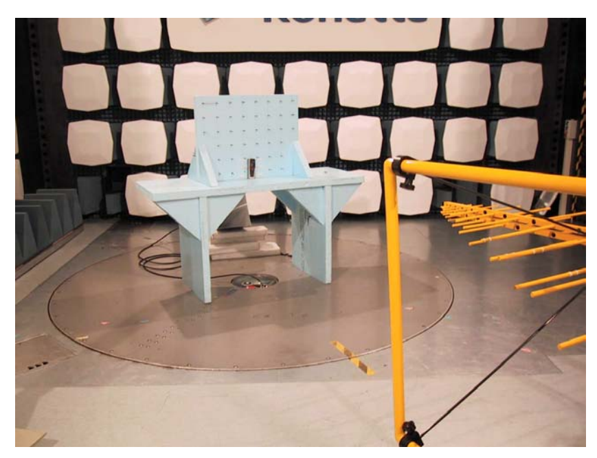
Radiated spurious emission measurement set-up for below 3 GHz Picture 2: measurements, EUT in vertical orientation