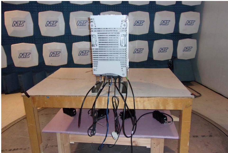
Radiated Spurious Emissions EUT setup