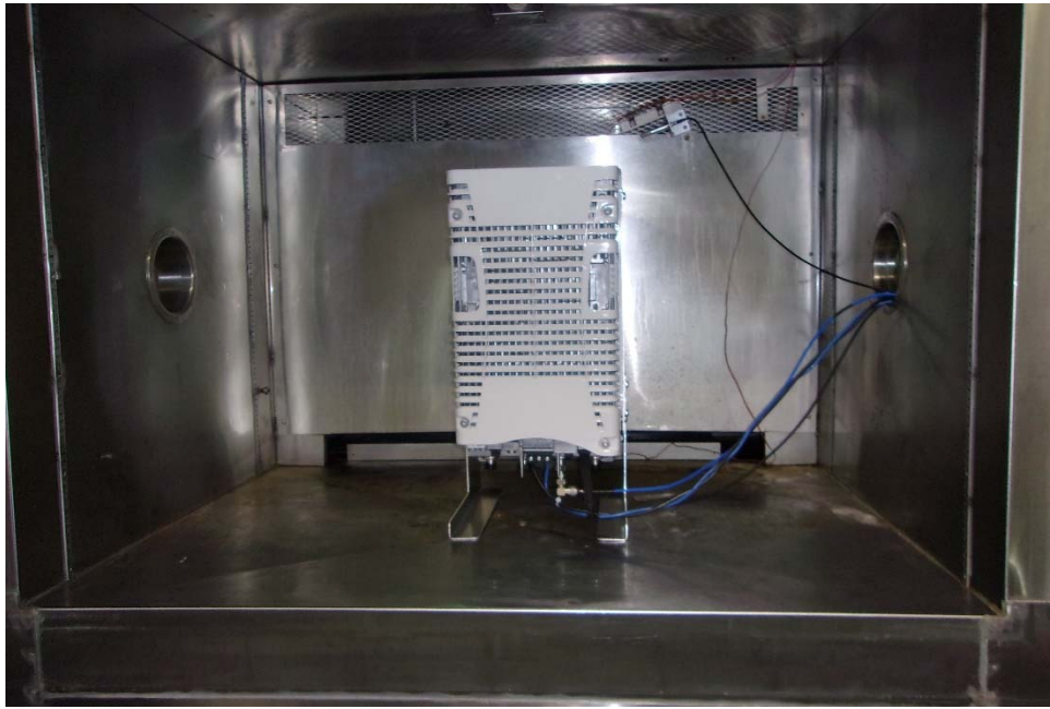
Frequency Stability Setup