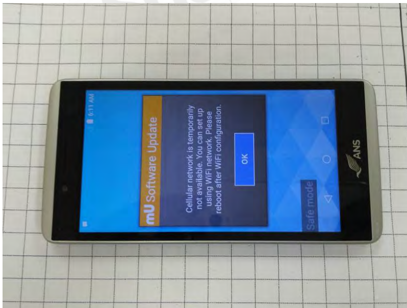
Fig. 3 Front view of EUT