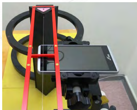
Fig. 2 Receiver of mobile contact center of Arch

Unless otherwise stated the results shown in this test report refer only to the sample(s) tested and such sample(s) are retained for 90 days only. This document is issued by the Company subject to its General Conditions of Service printed overleaf, available on request or accessible at www.sgs.com/terms_and_conditions.htm and for electronic format documents, subject to Terms and Conditions for Electronic Documents at www.sgs.com/terms_e-document.htm . Attention is drawn to the limitation of liability, indemnification and jurisdiction issues defined therein. Any holder of this document is advised that information contained herein reflects the Company's findings at the time of its intervention only and within the limits of Client's instructions, if any. The Company's sole responsibility is to its Client and this document does not exonerate parties to a transaction from exercising all their rights and obligations under the transaction documents. This document cannot be reproduced except in full, without prior written approval of the Company. Any unauthorized alteration, forgery or falsification of the content or appearance of this document is unlawful and offenders may be prosecuted to the fullest extent of the law.