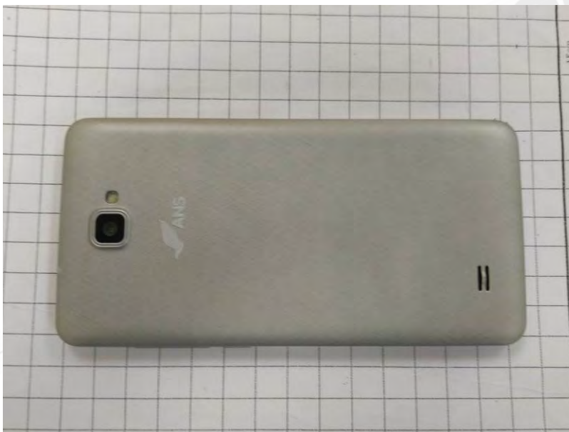
Fig. 4 Back view of EUT