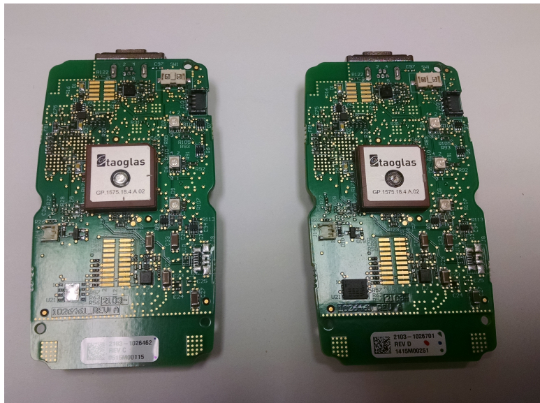
Illustration 1: Qollector1 on left, Qollector2 on right

The below internal photos of the device are the side by side comparison to justify the reasoning of why the Qollector1 is representative of Qollector2: