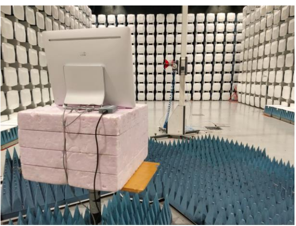
Radiated Emissions above 1GHz