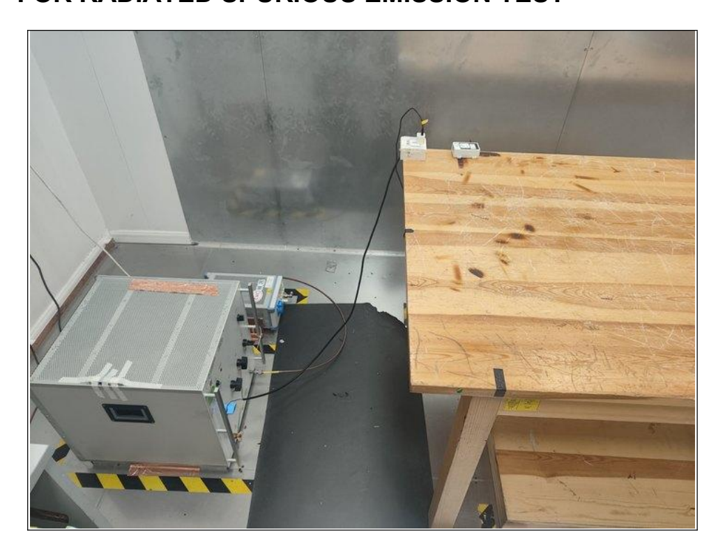
CONDUCTED EMISSION TEST