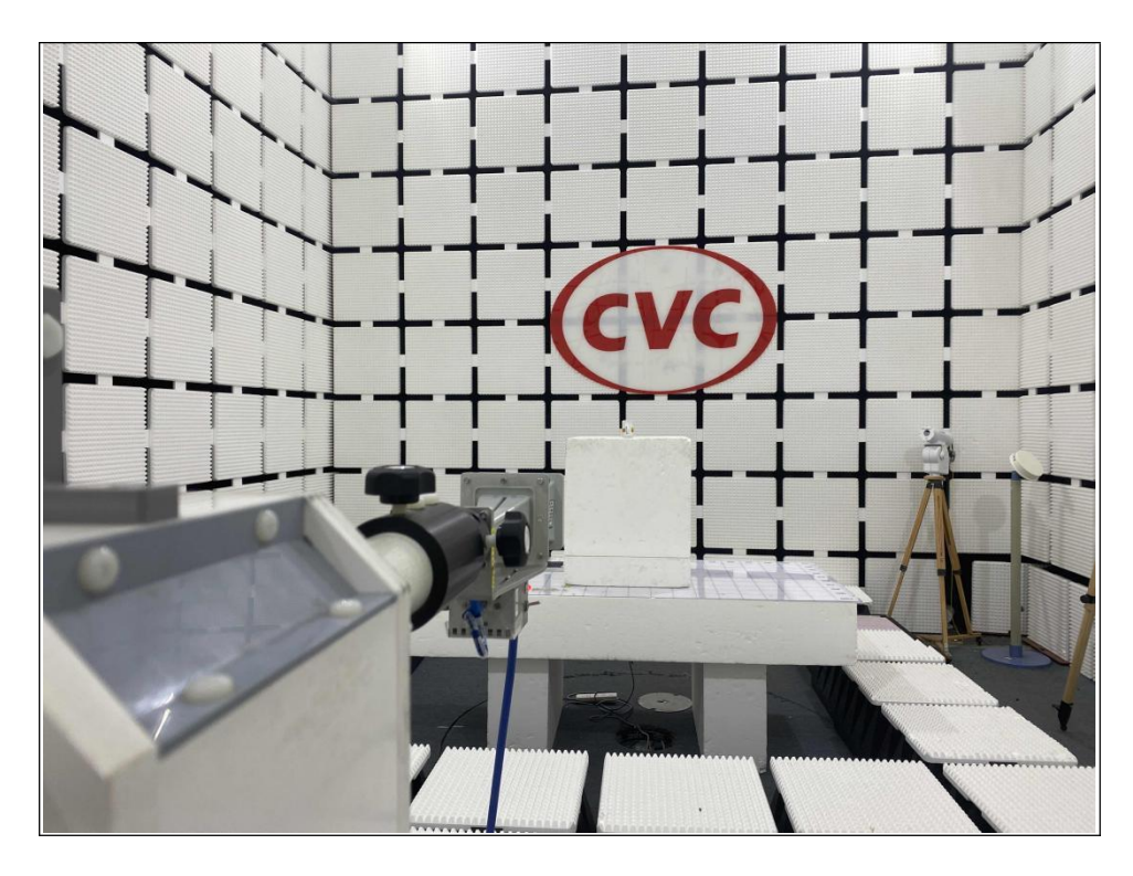
RADIATED EMISSION TEST (18GHz ~ 40GHz)