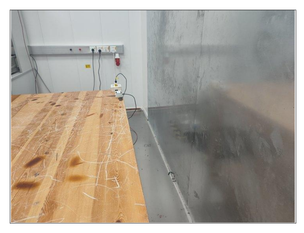
CONDUCTED EMISSION TEST