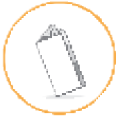
Instructions for Use