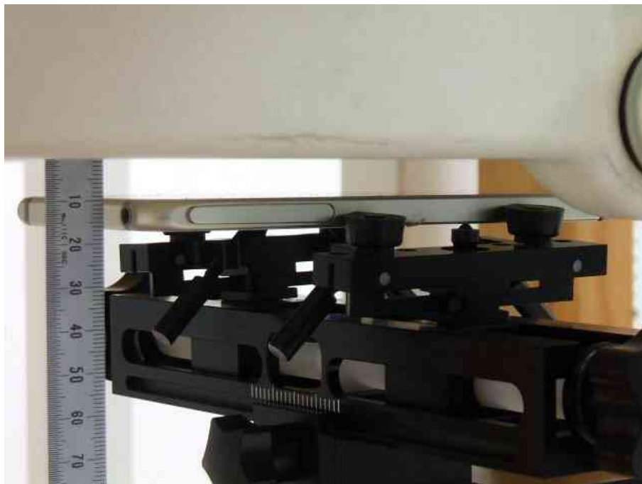
– Front –