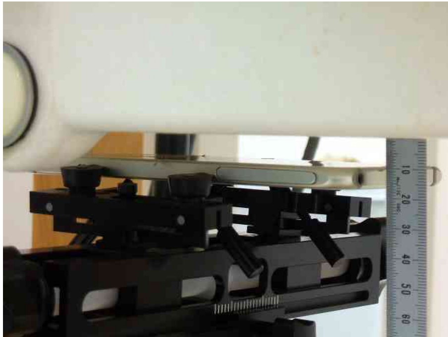
– Rear –