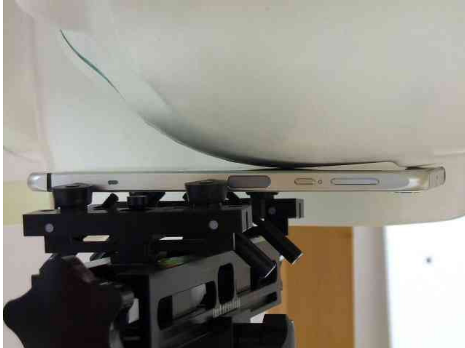
– Cheek-Touch Position –