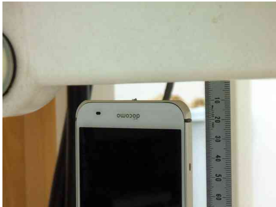
– Edge 3 (Bottom) –