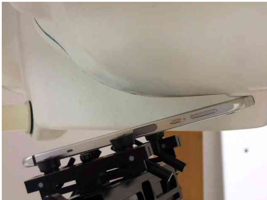
– Ear-Tilt Position –