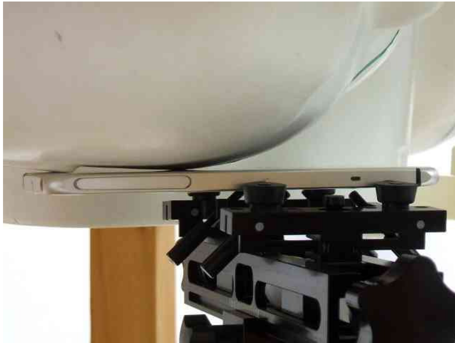
– Cheek-Touch Position –