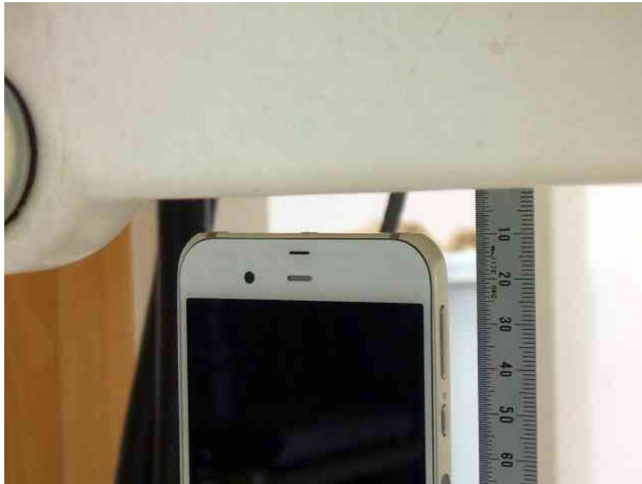
–Edge 1 (Top) –