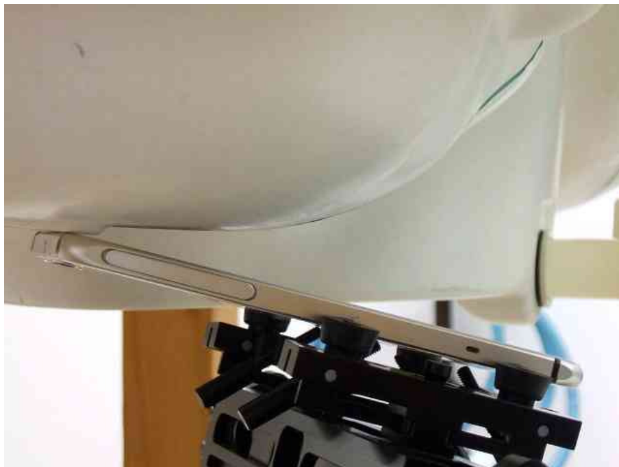
– Ear-Tilt Position –