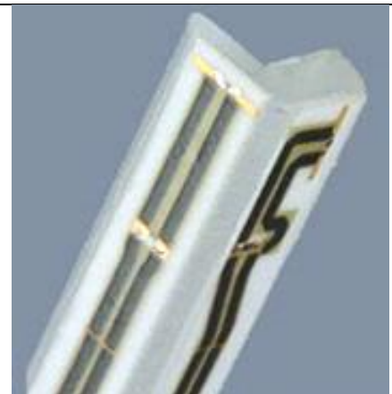
Fig 5.2 Photo of E-field Probe