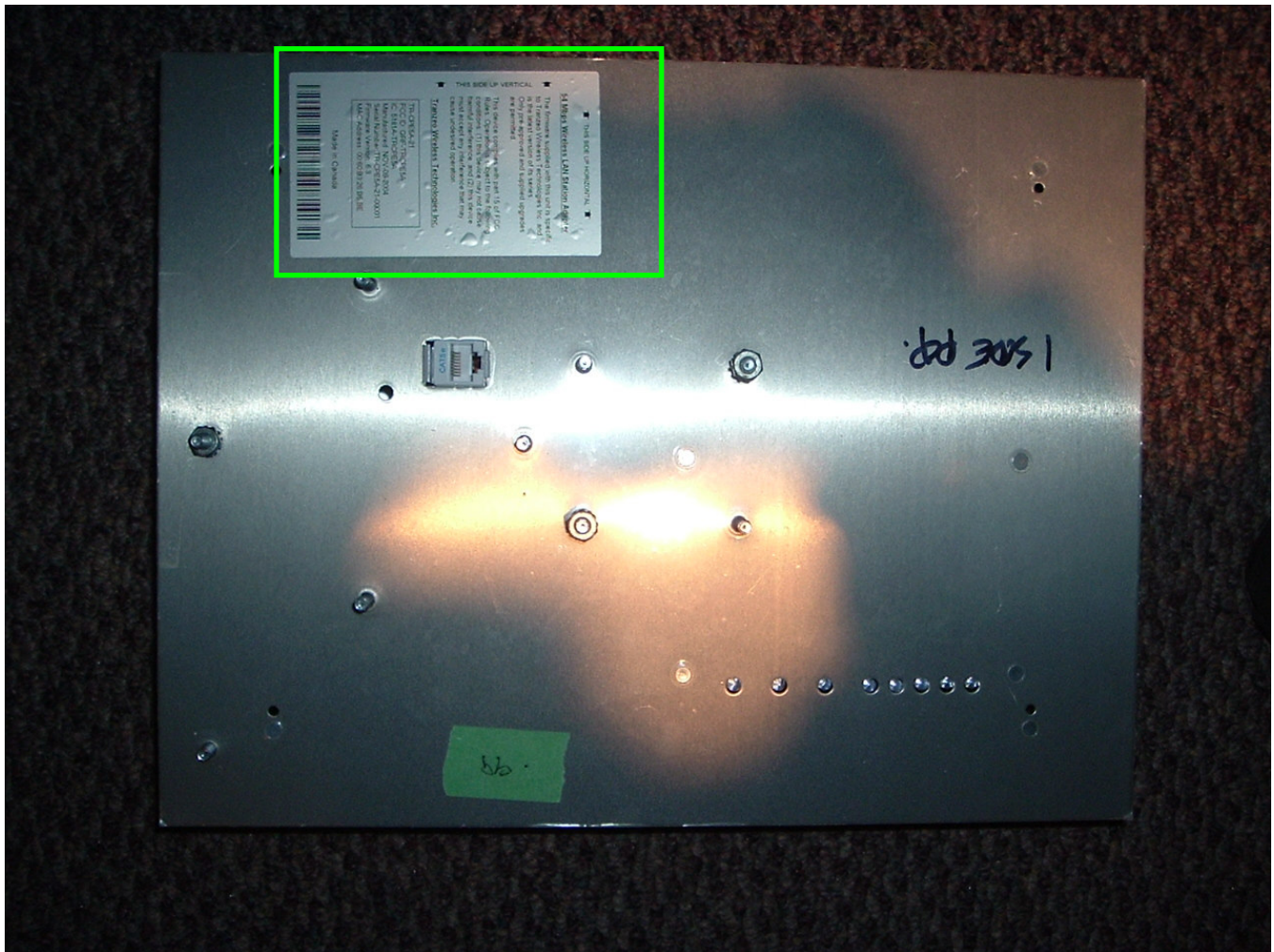
Figure 1 – External back panel, FCC Label location..