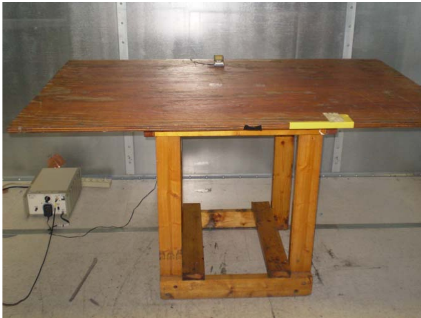
Figure 2. Part 15 AC Line Test Set-Up