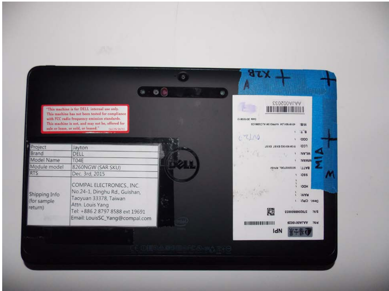
Back of Device