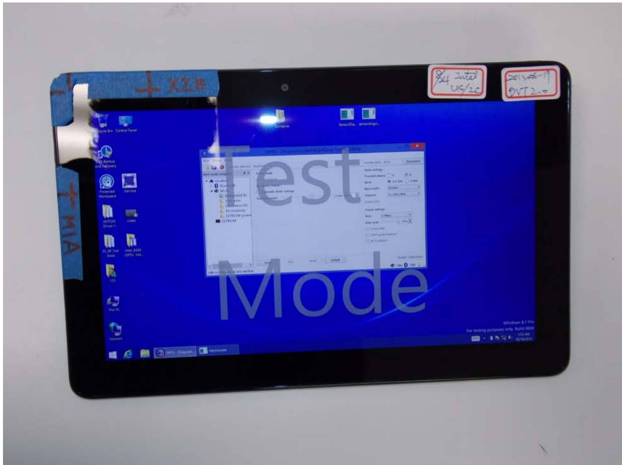
Front of Device