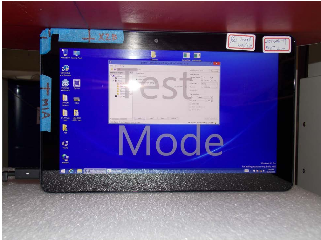
Test Position Top 0 mm Gap