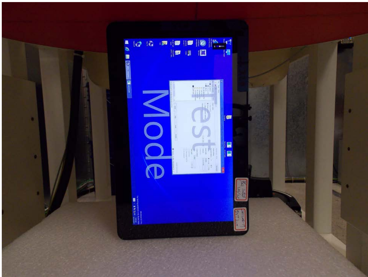
Test Position Left 0 mm Gap