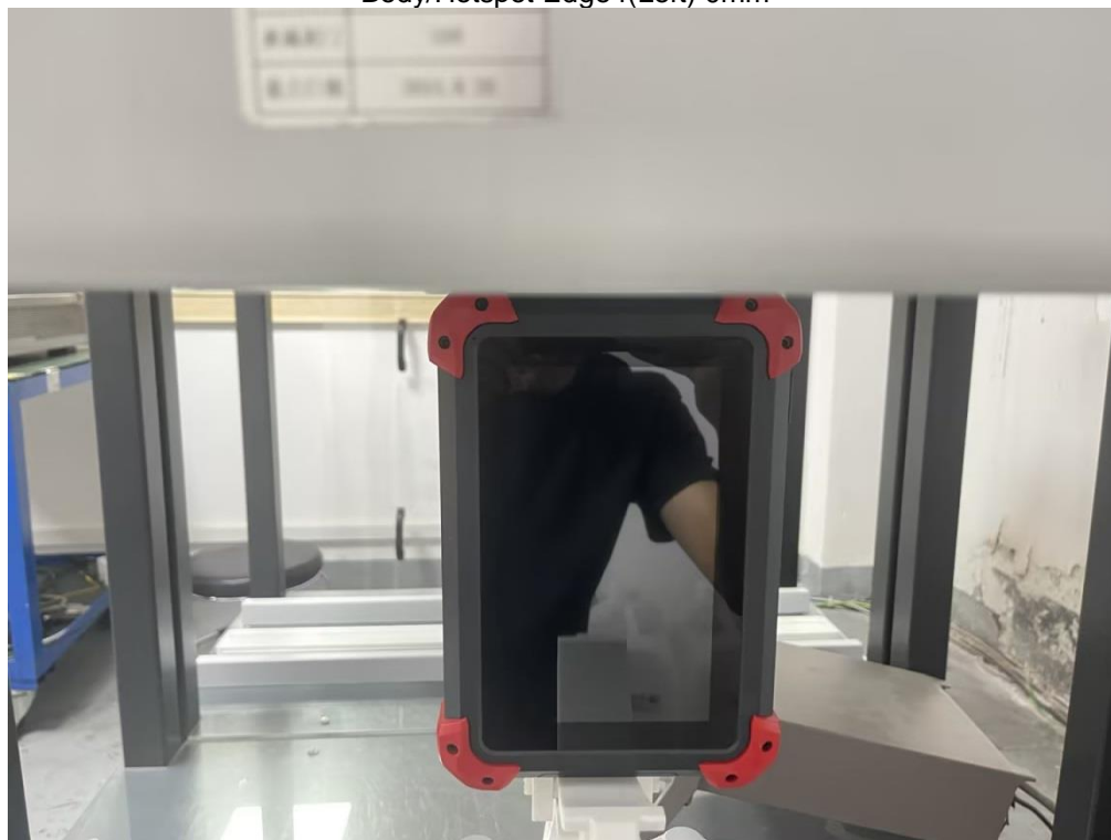
Body/Hotspot Edge4(Left) 0mm

Any report having not been signed by authorized approver, or having been altered without authorization, or having not been stamped by the "Dedicated Testing/Inspection Stamp" is deemed to be invalid. Copying or excerpting portion of, or altering the content of the report is not permitted without the written authorization of AGC. The test results presented in the report apply only to the tested sample. Any objections to report issued by AGC should be submitted to AGC within 15days after the issuance of the test report. Further enquiry of validity or verification of the test report should be addressed to AGC by agc01@agccert.com.