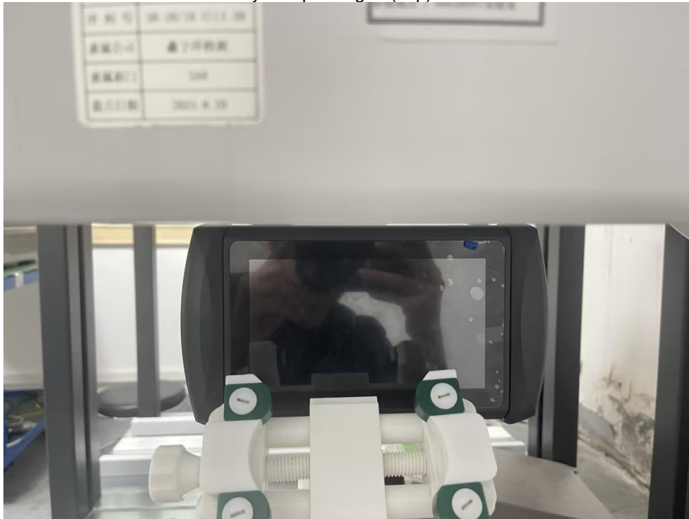
Body/Hotspot Edge4(Left) 0mm