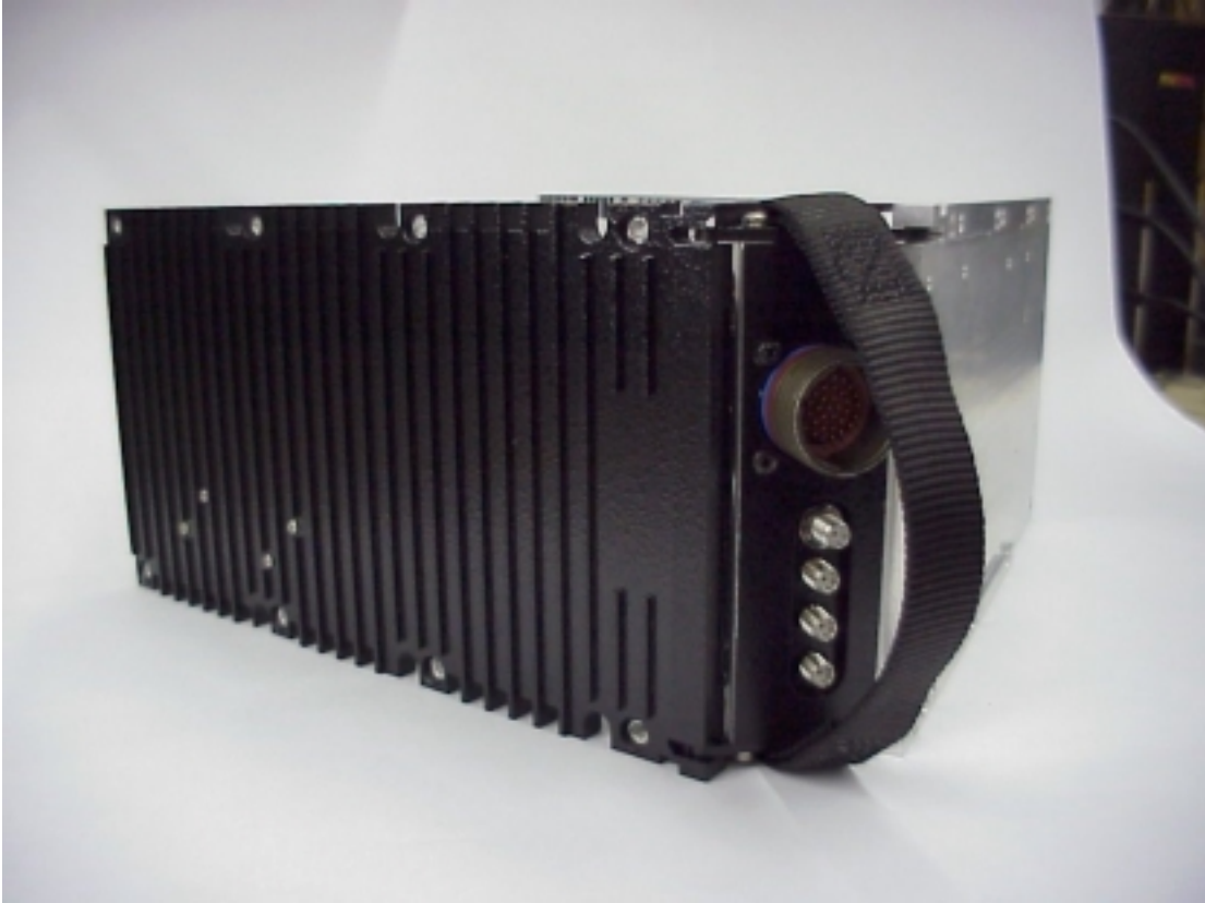
Rear-connector view, with unit open.