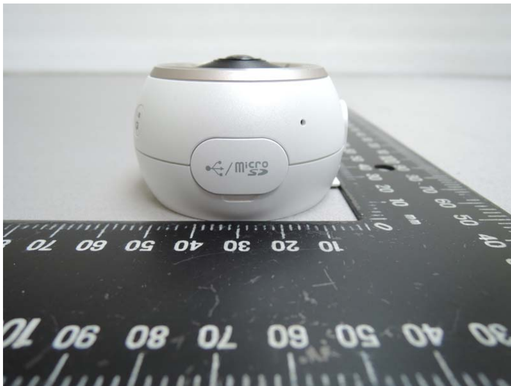
Side View of EUT – 3