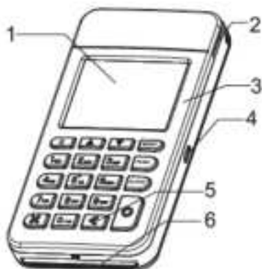
Figure 1.Front view