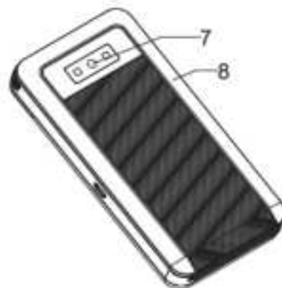
Figure 2.Back view