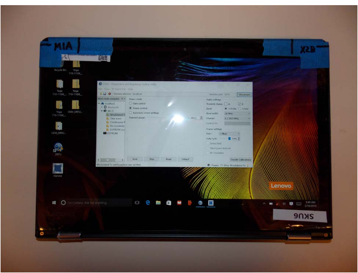
Front of Device Tablet Mode