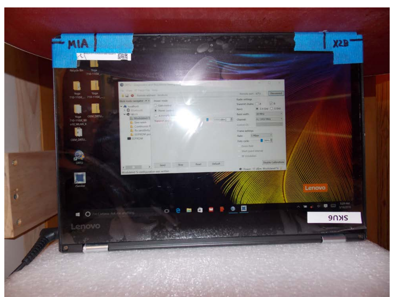
Test Position Top 0 mm Gap