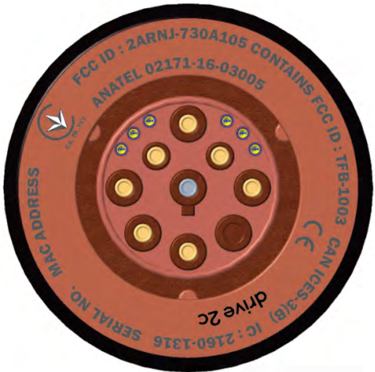
Picture 4 - Sample artwork depicting regulatory markings. In the final product, this text will be laser-etched on the bottom of the device at the time of manufacture. This style of marking can be seen in Picture 3.