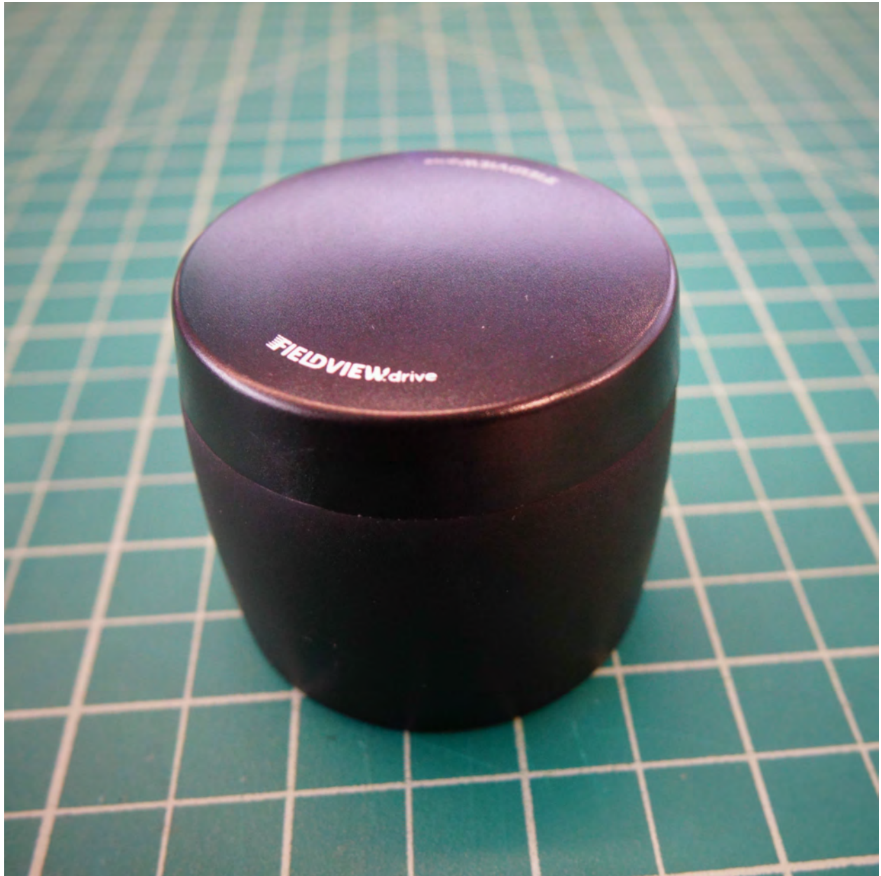
Picture 1 - Overhead view of FieldView Drive 2 enclosure.