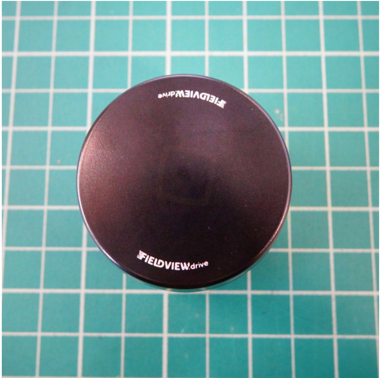
Picture 2 - Detailed view of FieldView Drive 2 enclosure top.