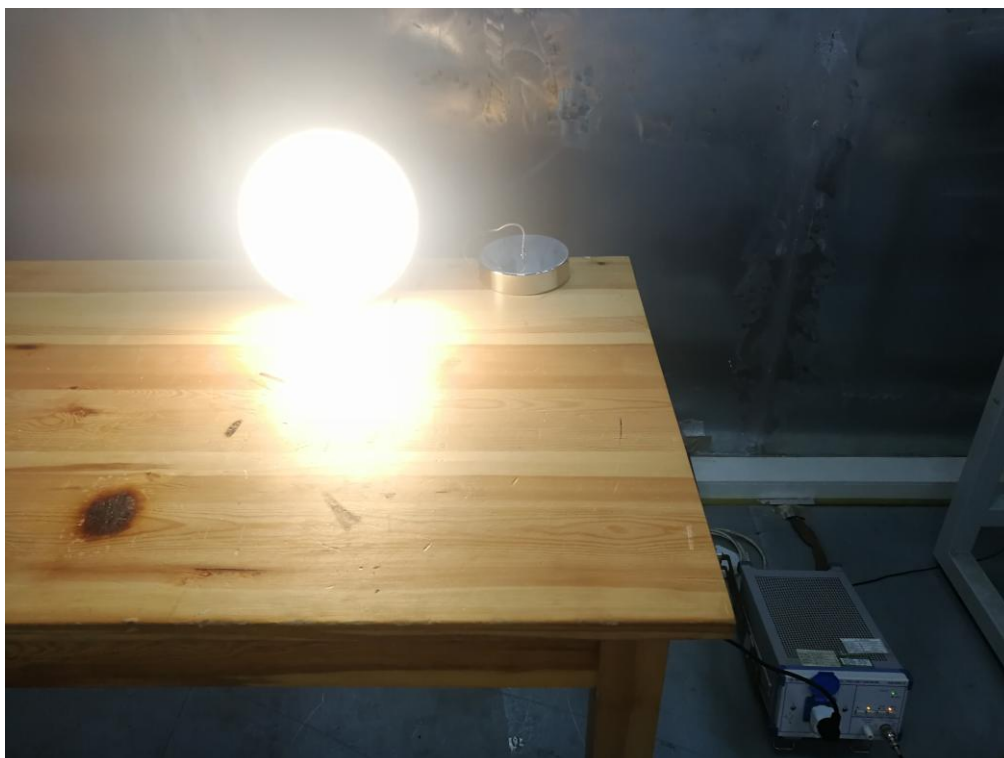
Photo of Power Line Conducted Measurement